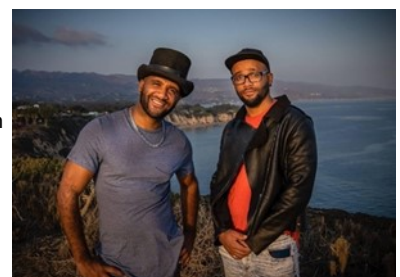
B2wins – July 8 at 7:00PM