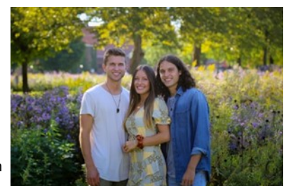
Girl Named Tom – June 25 at 8:00PM