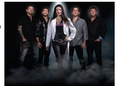
Frontiers: The World's Number One Tribute To Journey – June 3 at 8:00PM

Stay informed of all the amphitheater upcoming events by following the Fountain City Amphitheater Facebook page or by visiting our website. cityofbryan.com/fcamphitheater